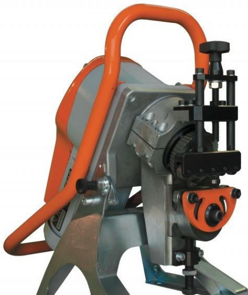
Chamfering system UZ12 ULTRALIGHT - KIT 30° + 45° Maximum bevel width 12 mm with automatic feed

The UZ12 ULTRALIGHT is one of the lightest automatic beveling machines advance in the market. Thanks to its compact size and light weight it is not only suitable for workshops, but also for assemblies. The Machine is equipped with the automatic feed and therefore does this Working with the UZ12 ULTRALIGHT very comfortably.